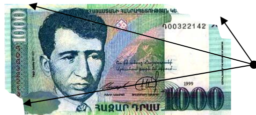
An insignificant torn