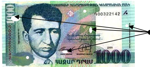
In an insignificant way poked, worn out, stains and written notes